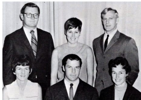
1970 PHYS ED DEPARTMENT