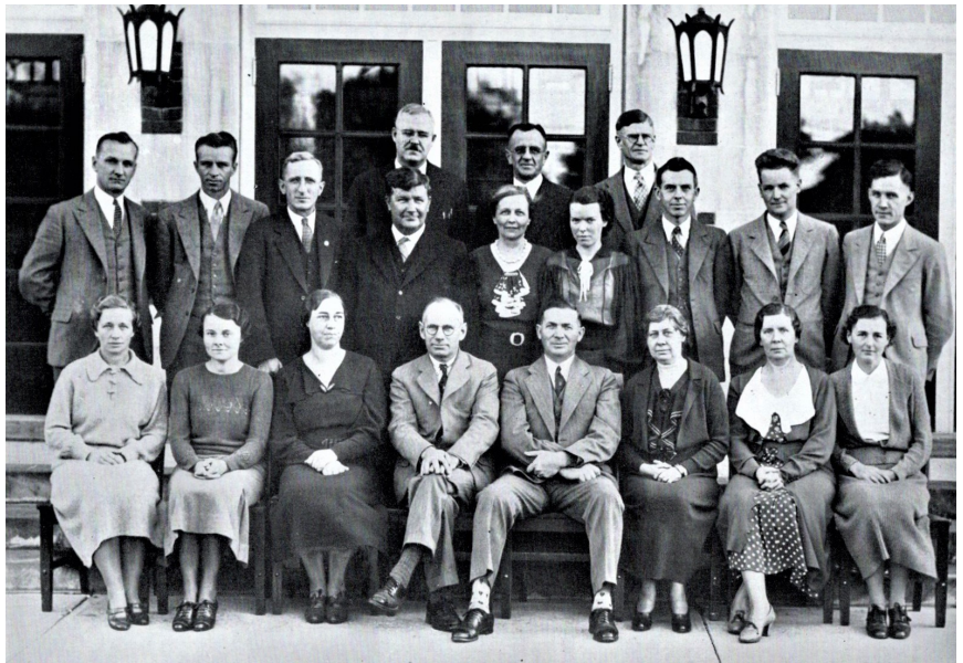
SOUTH STAFF 1935