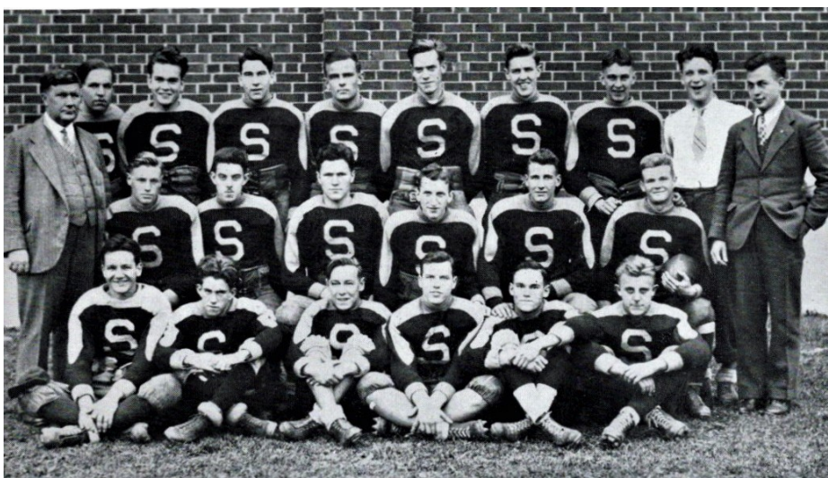
1935 SENIOR RUGBY TEAM