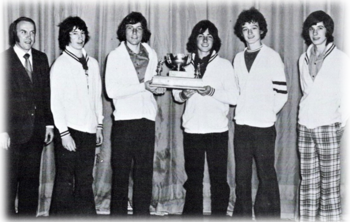
1973 BOYS CURLING B TEAM

the North branch of the Thames, (Thames Valley Parkway) (2020), Western's new Music School (2017) and the 4-floor addition to the Engineering School (2009), the first LEED (Leadership in Energy and Environmental Design) certified building at Western. The Entrepreneurship and Innovation Centre, currently under construction, will be Western's first net-zero energy building, including features such as geothermal (ground-source) heat and cooling, green roof, triple-glazed windows and generous use of natural light.