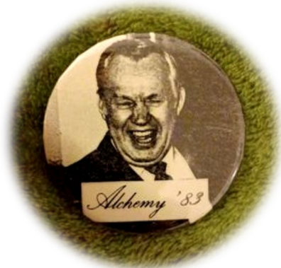
Retirement button, 1983