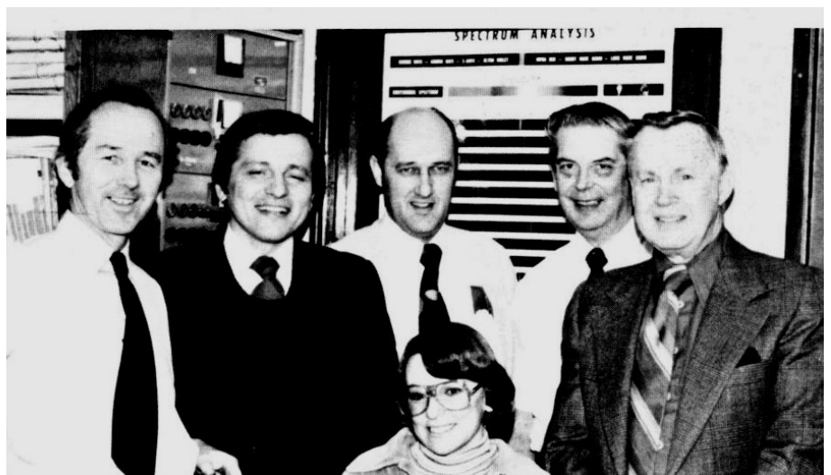
Science Department, 1978