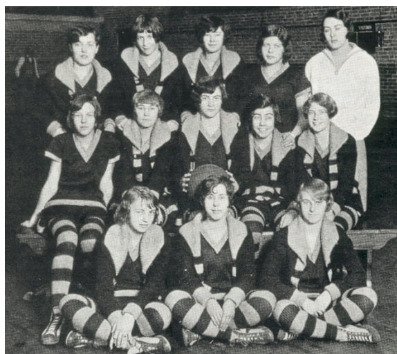
GIRLS' 2ND YEAR BASKETBALL TEAM

Anyone with a connection to South is encouraged to dig into their roots to see who else attended our beloved school. You never know who might be a fellow Lion!