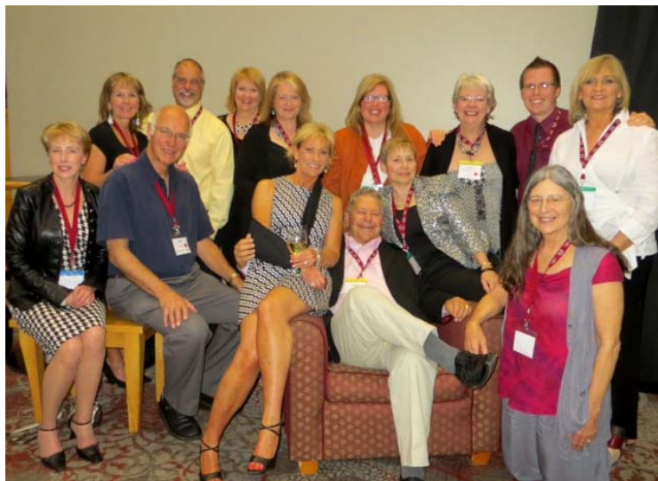
Members of the 85th Anniversary Reunion Committee